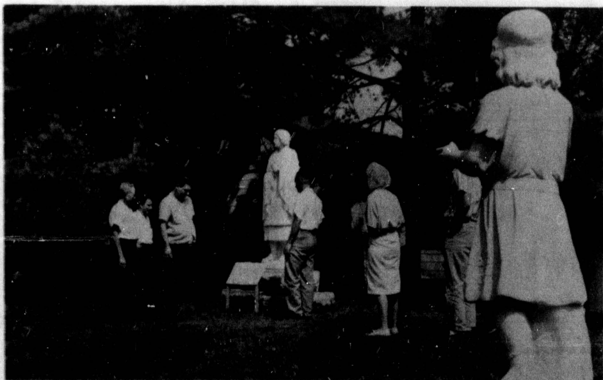
Pilgrims and visitors to Martyrs Shrine at Auriesville, N.Y. where Ven. Kateri Tekakwitha, the Lily of the Mohawks, was born, visit her memorial in front of the Kateri Museum.

made Bishop Gibbons a chief of their people. His investigation proved successful.