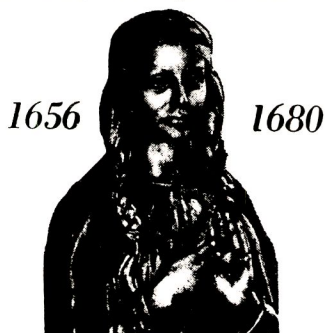
VENERABLE KATERI TEKAKWITHA

6969 STRICKLER ROAD CLARENCE CENTER, NEW YORK 14032