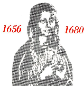
VENERABLE KATERI TEKAKWITHA

6969 STRICKLER ROAD CLARENCE CENTER, NEW YORK 14032