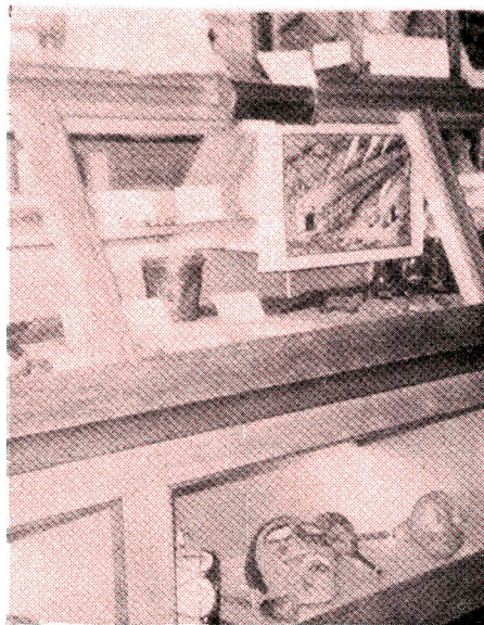
Museum's Artefacts at Fonda

excavated Mohawk Indian Castle (Village) of Caughnawaga. It was honored this year by the U. S. Department of the Interior by