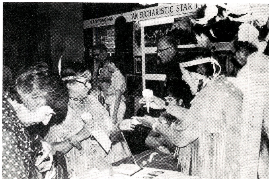
Paleface ice cream melts a busy moment at Kateri Booth.