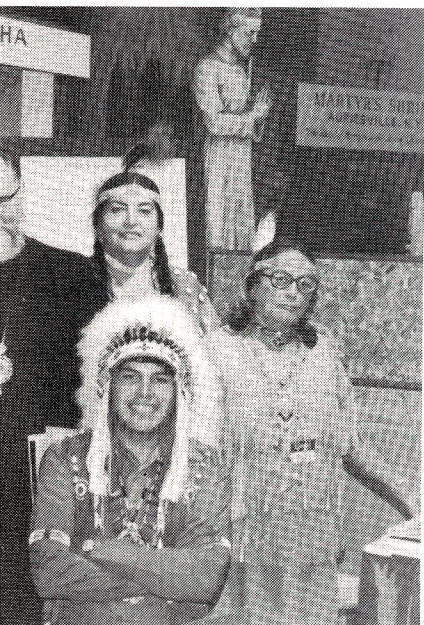
ussia with his secretary (left) is