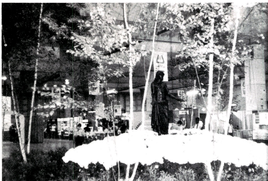
Jesus' Baptism - main display in Civic Center.