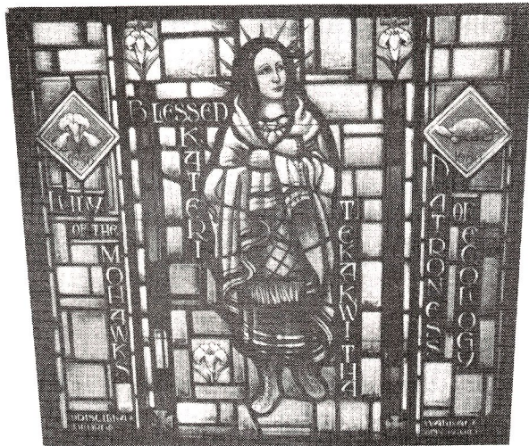
Blessed Kateri window in the Wallace's Parish Church, Marcus Hook, Pa.

Help give Century II Fund a big boost, please!