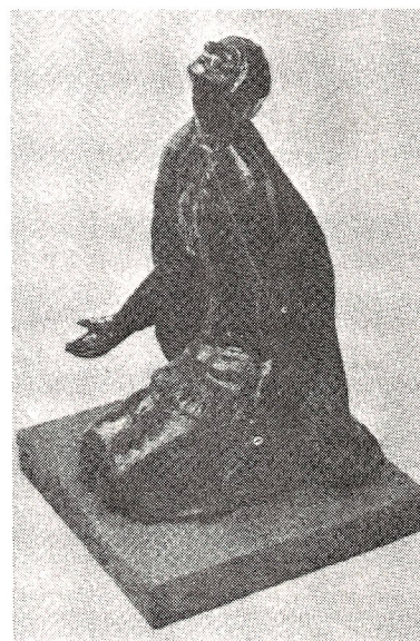
Contemplative Kateri In Art