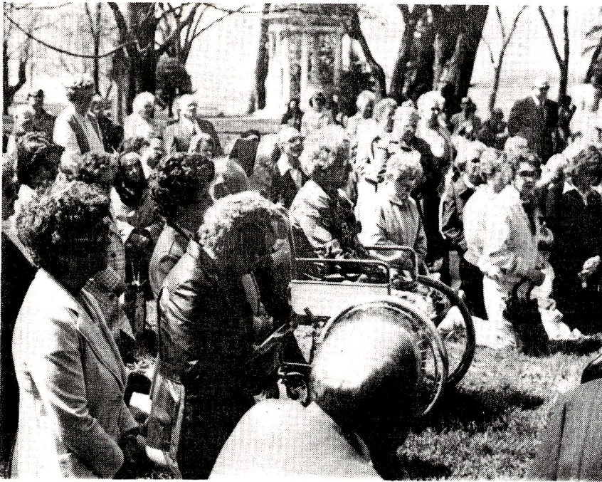
DEVOTED KATERI FOLLOWERS in prayer at the final outdoor ceremony on May 2, the transferred feast day.