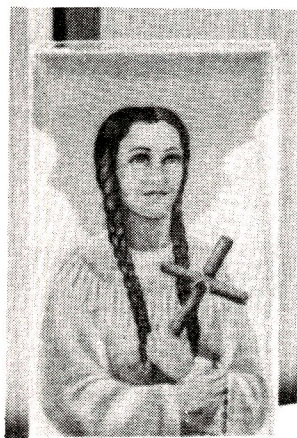
BLESSED KATERI TEKAKWITHA

An attractive stand-up plastic easel with an official Blessed Kateri picture — $2.50. Order from League Office, Auriesville, N.Y., 12016. Send your name, address, city, state, and zip code, with payment. Merry Christmas!