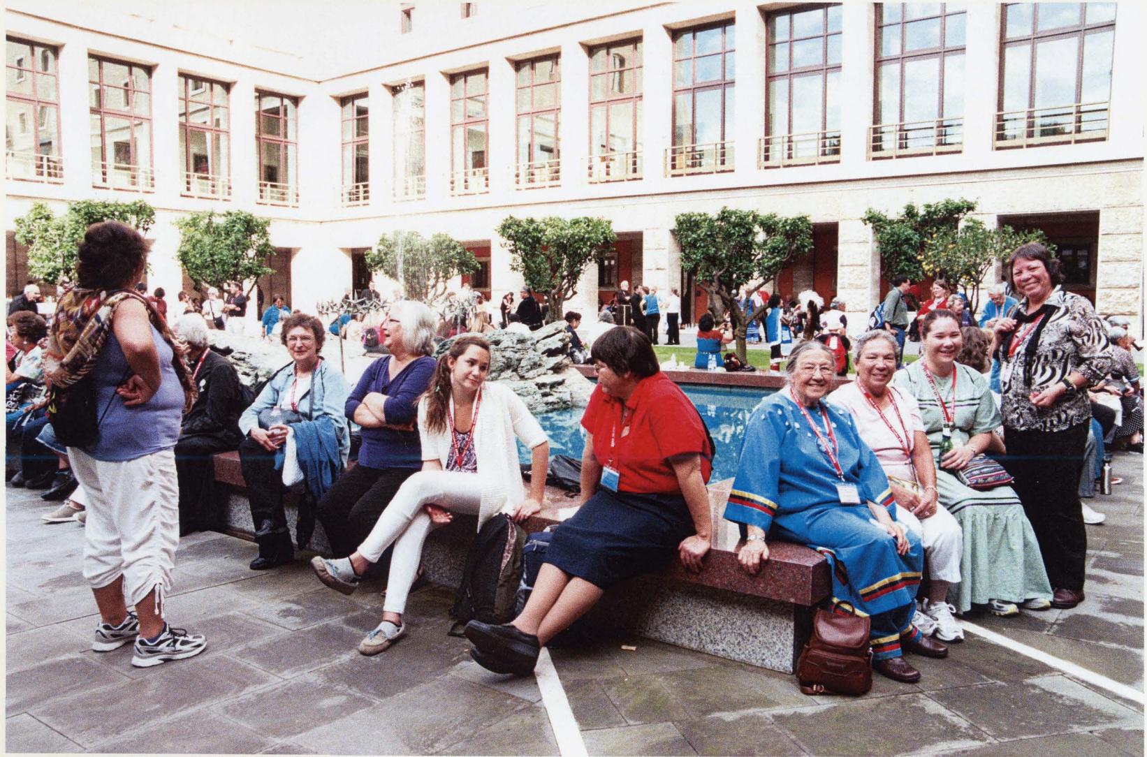
The North American College in Rome, which educates young seminarians, graciously hosted a Reception for friends of Kateri.