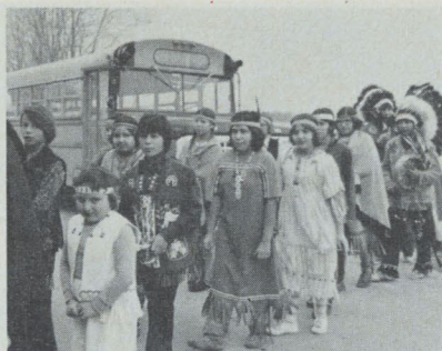
Indian children in their colorful costumes follow the Knights.