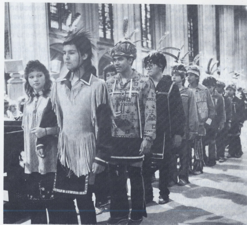
SPECIAL HERITAGE - Young American Indians in colorful garb file through St. Patrick's Cathedral on May 25, 1989 for Mass commemorating 85th anniversary of the Marquette League.

(When acknowledging favors to Kateri, be sure to indicate details.)