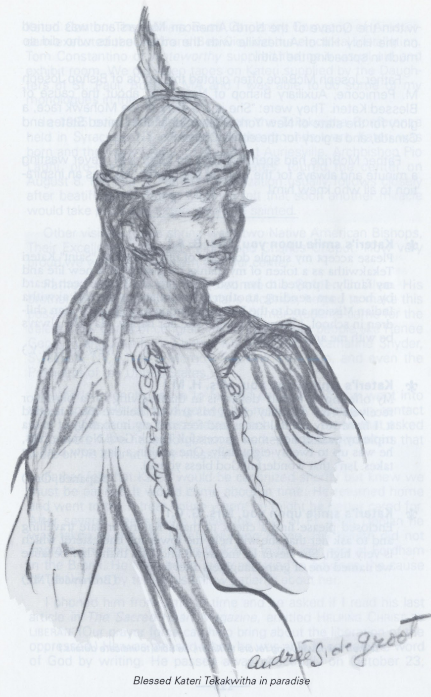
Blessed Kateri Tekakwitha in paradise