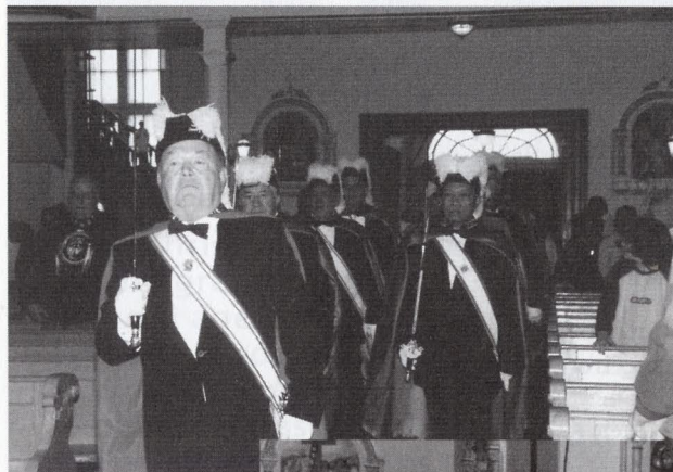
The Knights open the entrance procession.