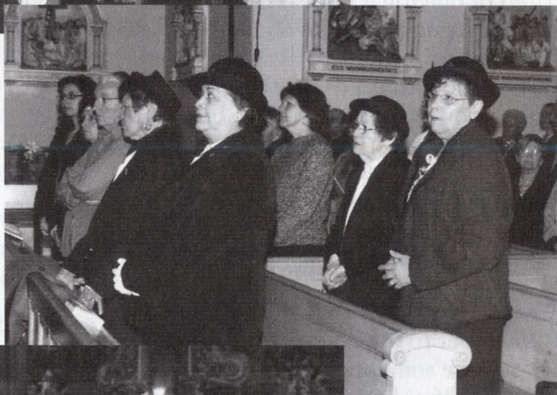
The Daughters of Isabella join the ceremony.