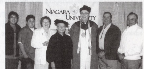
Her relatives and friends of St Regis come to congratulate her.