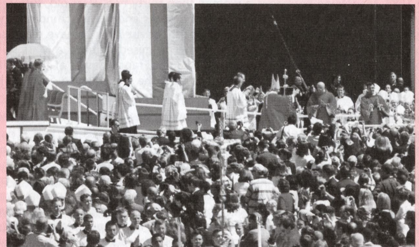
The Mass Recessional.