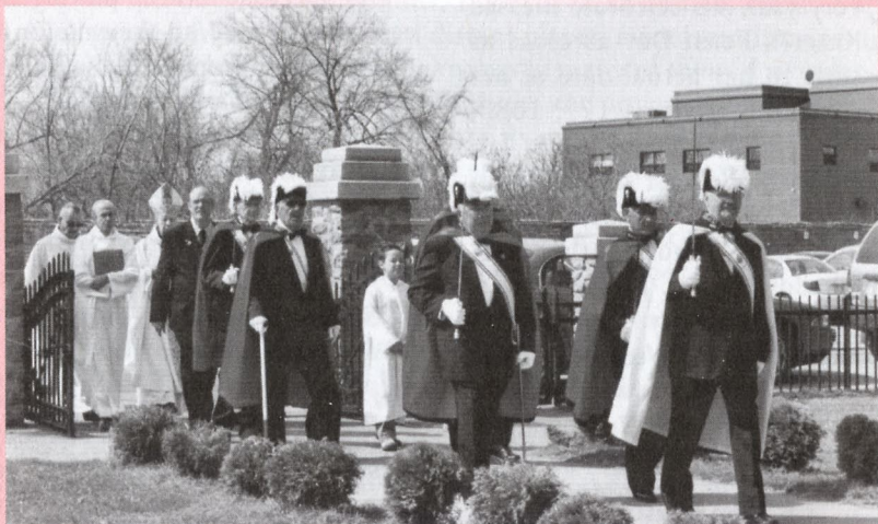
The Knights of Columbus leading the procession into the Church.