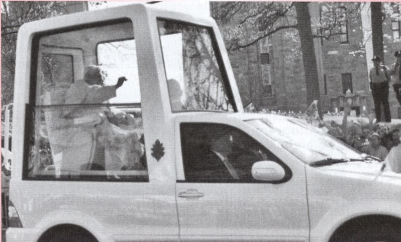
Pope Benedict XVI greets the enthusiastic crowd as he nears the Basilica Shrine.