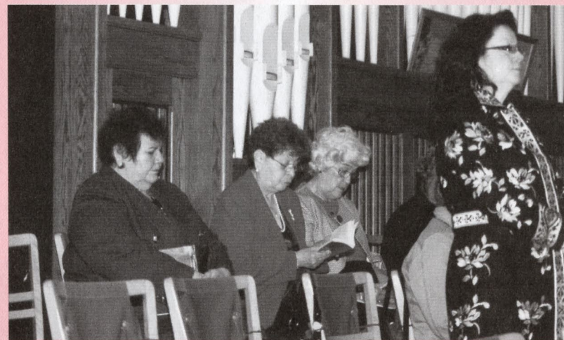
The Iroquois Choir.