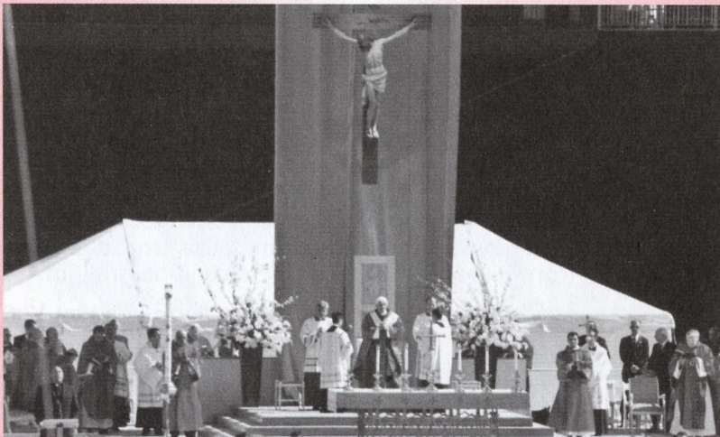
The beginning of the Mass at the Nationals Baseball Stadium.