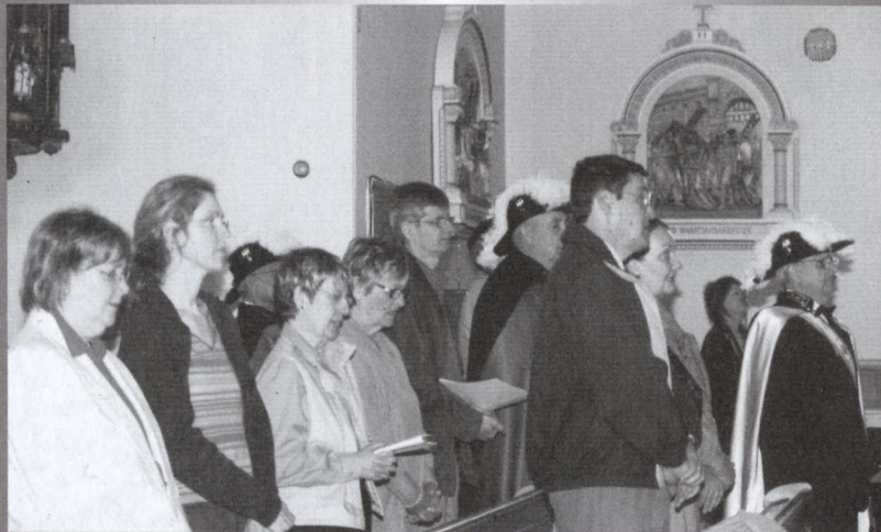
Kahnawake Residents and Visitors.