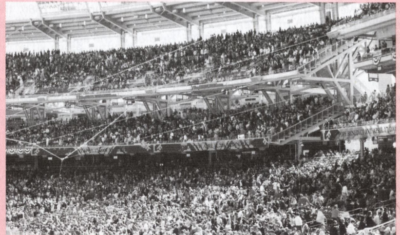
Part of the 47 000 attendees at Pope Benedicts Mass at the Nationals Stadium.