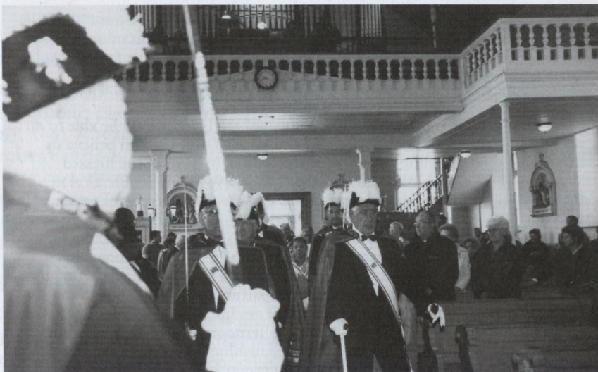
Blessed Kateri's Feast Day Mass Grand Entry