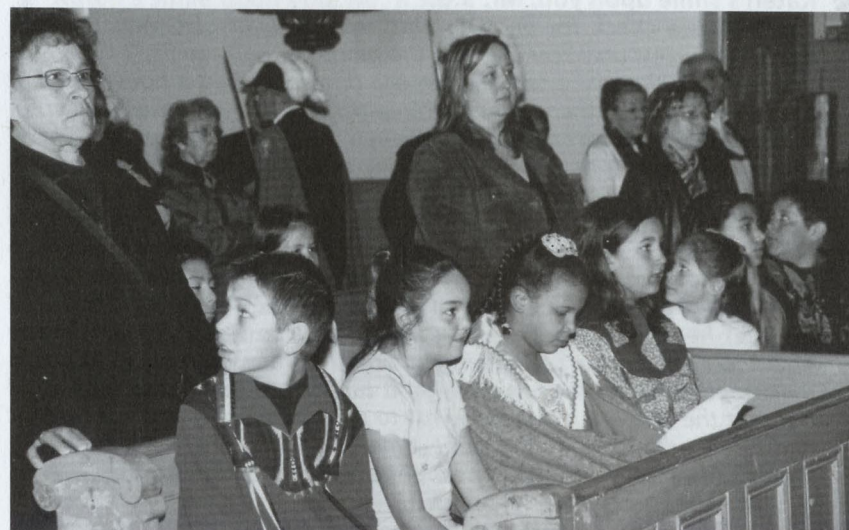
"Faith First" children and volunteer instructors