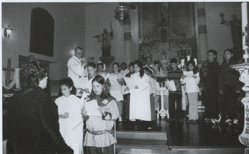
"Faith First" children reciting Lord's Prayer in Mohawk