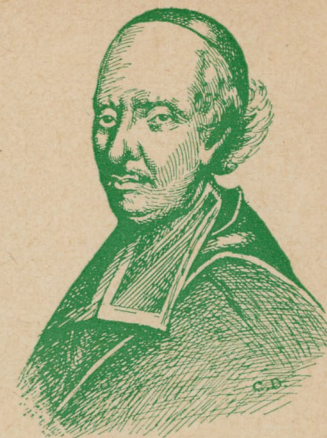
Ven. Bishop François de Laval.

Thus were they all filled with the grace of baptism which they conserved even in the woods, being exact about making their morning and evening prayers. This manner of wintering became the rule for all the succeeding winters and has since sanctified many Indians in the woods, where a few died after the fashion of the elect, where others lived as angels, six months at a time, and where others exposed themselves for the faith and acted as apostles, preaching all winter to those who were not yet Christians.